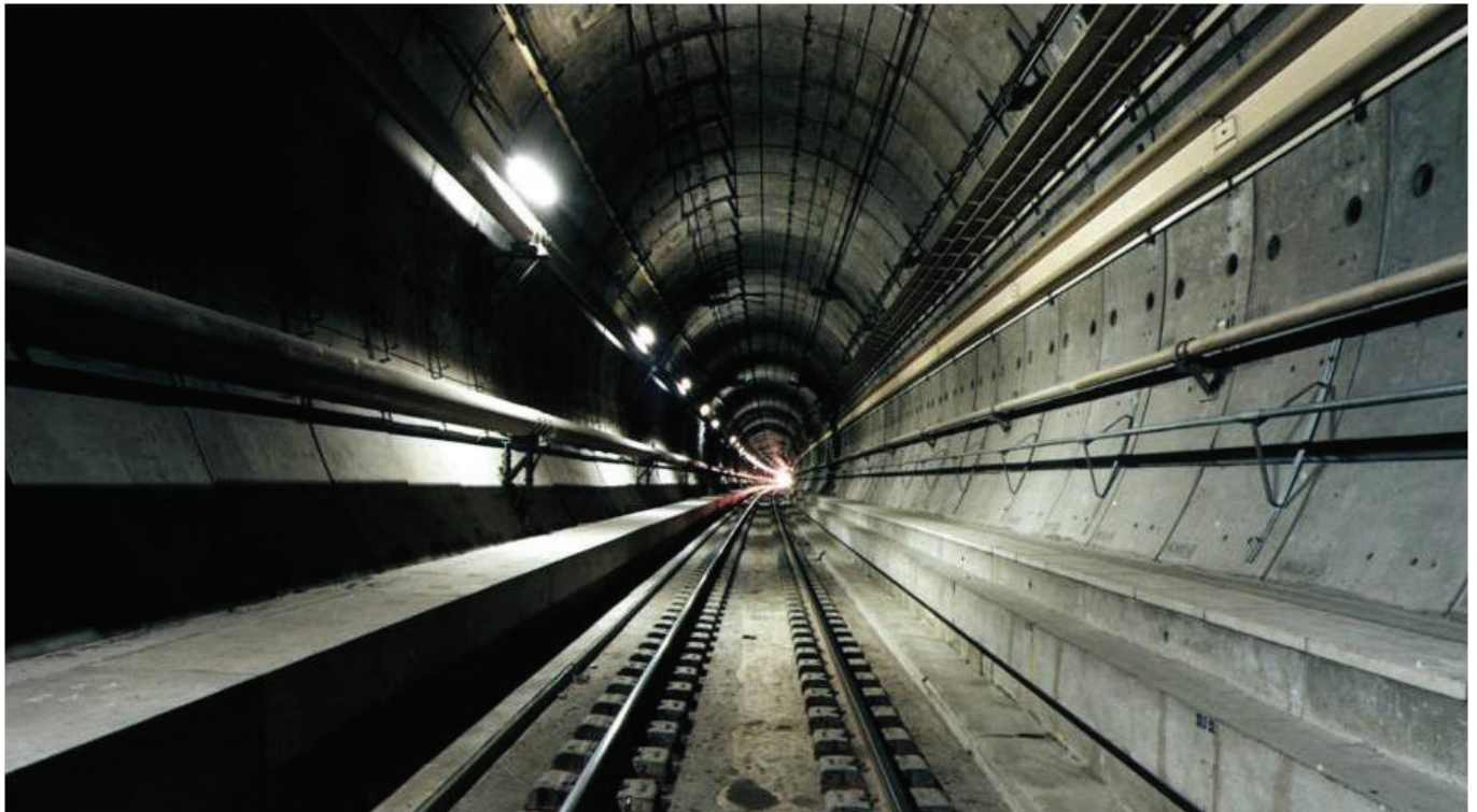
View inside one of the running tunnels

throughout the Tunnel, must remain fully functional at a temperature of 1,000°C. Using grade EN 1.4401/AISI 316 for their construction ensured they achieved this target in compliance fire tests.