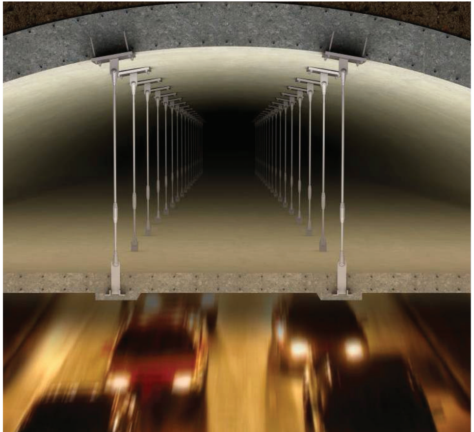
The North-South Bypass in Brisbane is Australia's longest road tunnel

Stainless steel is available in a range of alloys and product forms and can meet the most arduous conditions. It requires no added protection for corrosion resistance and its high strength and fire resistance properties provide a long and durable service life, with little or no maintenance. Tunnel engineers deploy stainless steel in both visible applications, such as fire doors and barriers, and invisible applications such as reinforcing.