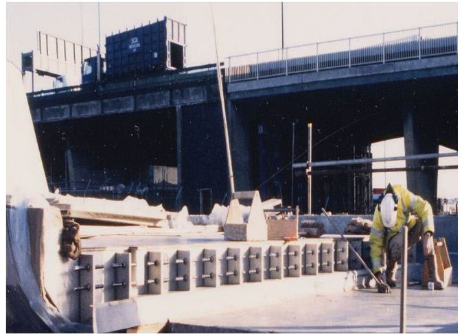
Stainless steel deck joints were installed in the Dartford River Crossing to counter the corrosive effect of de-icing salts

To prevent the edges of the slab breaking up and allowing more water to penetrate, 396 tonnes of austenitic stainless steel (EN 1.4401/AISI 316) deck joints were incorporated into the concrete slabs at 4.5 m intervals.