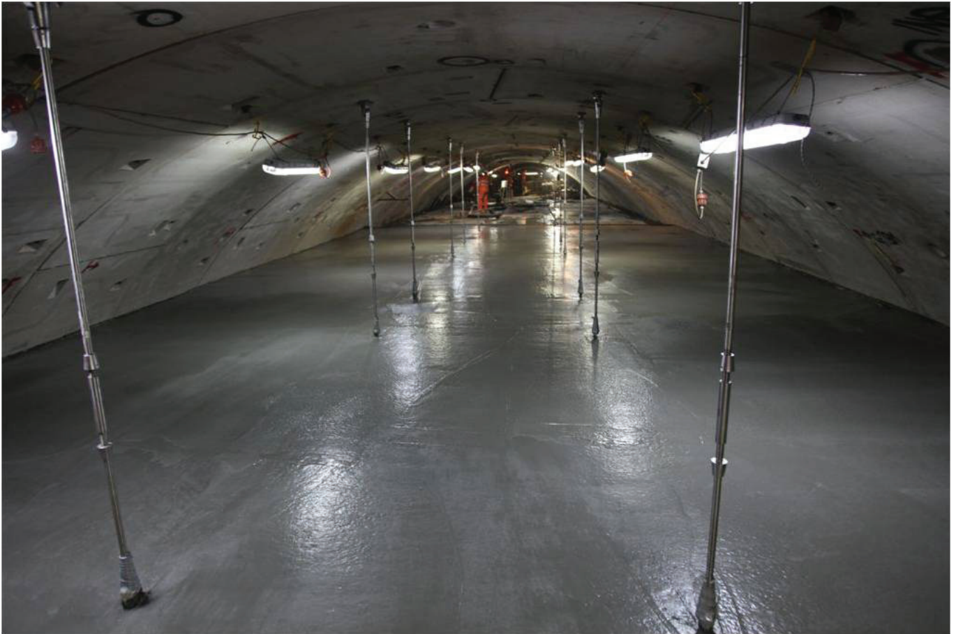
Brisbane's North-South Bypass uses 33,000 light gauge stainless steel posts as lining supports in a highly corrosive atmosphere

The longest road tunnel in Australia is the North-South Bypass (also known as the Clem Jones Tunnel or CLEM7) in Brisbane. Comprised of two 4.8 km twin-lane tunnels, CLEM7 has been built under the Brisbane River. Duplex stainless steel (EN 1.4462/ASTM-UNS S32205/S31803) was specified for use throughout the tunnel due to its ability to withstand the highly corrosive environment. Applications included the use of 33,000 light gauge stainless steel posts as tunnel lining supports.