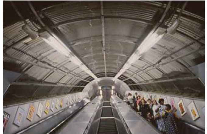
London's Underground network has 270 stations and relies on stainless steel to keep people moving - and safe!

Stainless steel was extensively used in the tunnels and stations of London's Jubilee Line when it was extended to the revitalised docklands area to the east of the capital.