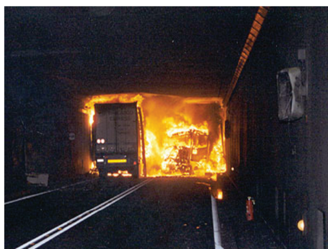
Fires in road tunnels can cause catastrophic damage to people and tunnels

Solutions to prevent or minimise the devastating effects of road tunnel fires inevitably use stainless steel. This is due to its excellent performance at the elevated temperatures generated by hydrocarbon fires.