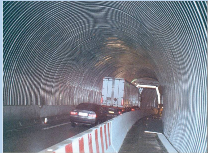
Over 12,000 m 2 of stainless steel mesh protects traffic from spalling concrete

On the A10 (Genoa to Savona) alone, 25 tunnels have required extensive repairs to stop spalling concrete falling onto the motorway. Over 12,000 m 2 of stainless steel mesh (EN 1.4401/AISI 316) has been used to line the tunnels. The mesh catches any falling lumps of concrete and directs them away from the road surface.