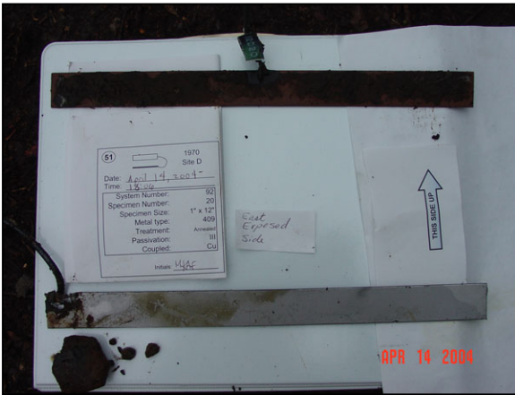
Left: Galvanic coupled sample set (April 2004).