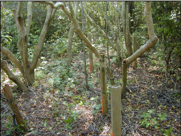
Above: Site D June 2003 conditions.