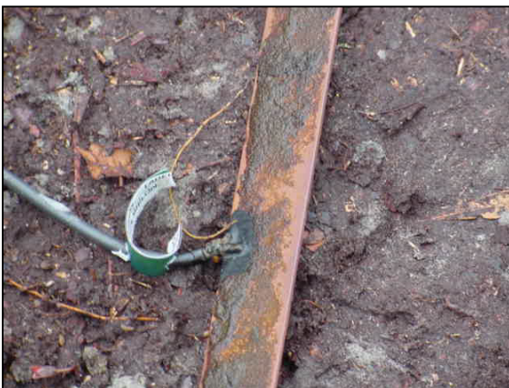
Below Right: Close-up of 409 stainless steel cathode at corner with attached wire (April 2004).