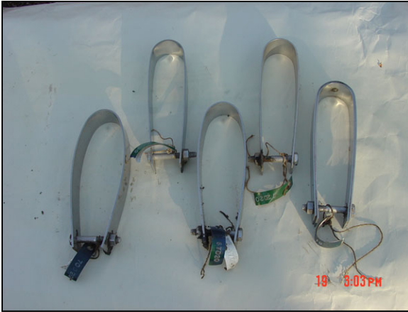
Above Left: U-bend stressed corrosion samples upon recovery (April 2004).