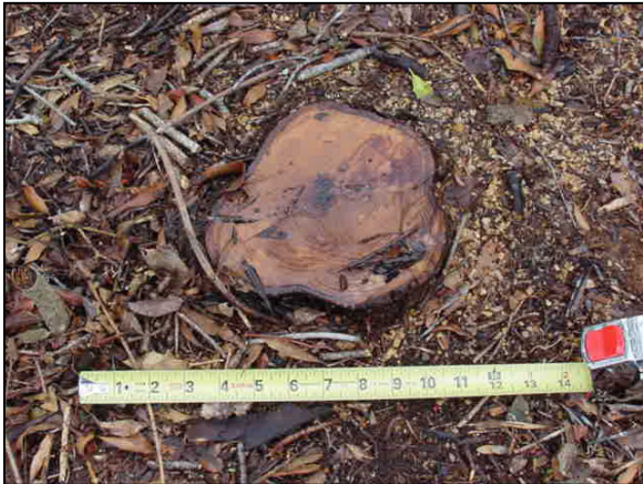
Below: This tree stump - with 30 tree-rings – was in the center of the 1970 trench (April 2004).