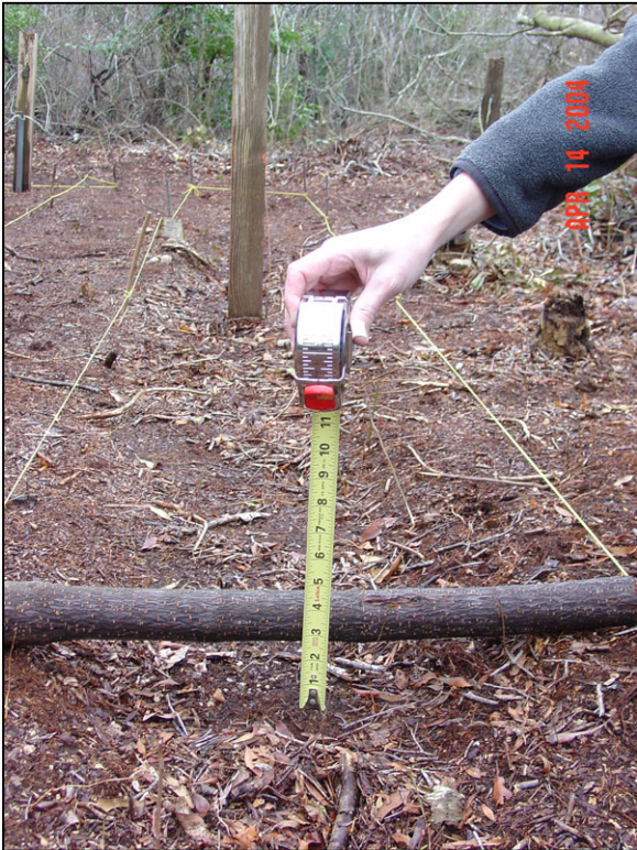
Left: One of the 1971 coupon trenches with subsidence directly over the coupon locations (April 2004).